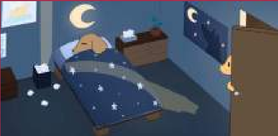
Kira - Noodog