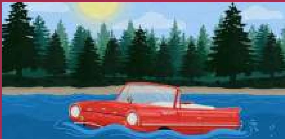
Faith - Amphicar770