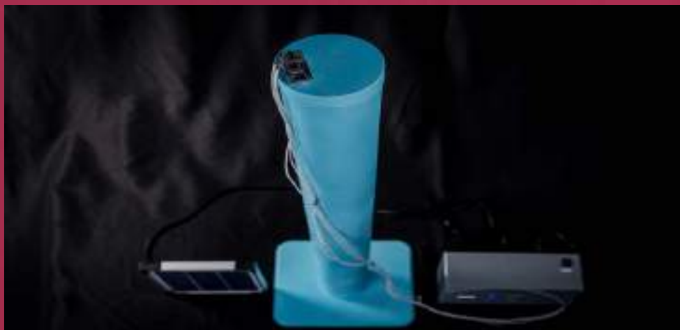
Alistair - Off-Grid Digital Water Tank Meter