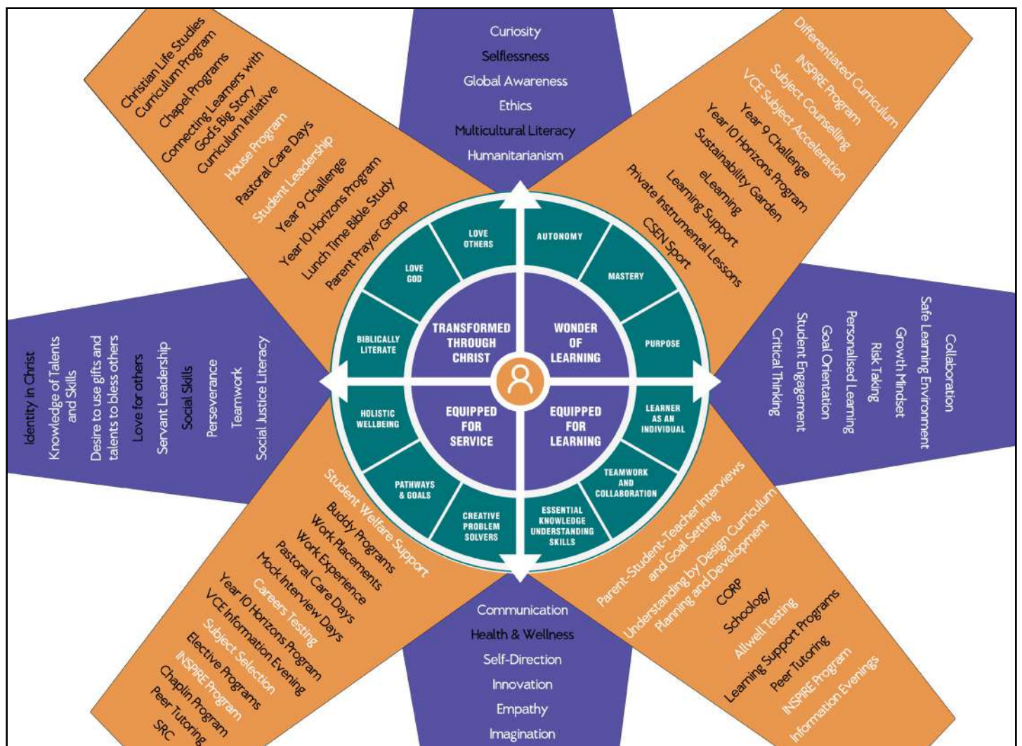
Figure I: The Northside Christian College Teaching and Learning framework as it applies to the INSPIRE program

Listed in each spoke are the programs and initiatives that align with the central teaching and learning values of the College. Those in white are currently offered by INSPIRE.